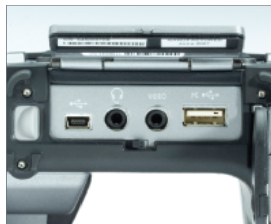
From Left to right: USB mini for PC image download, 4 pole audio for voice annotation, NTSC video, USB-A for memory stick image transfer