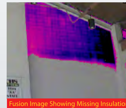
Fusion Image Showing Missing Insulation