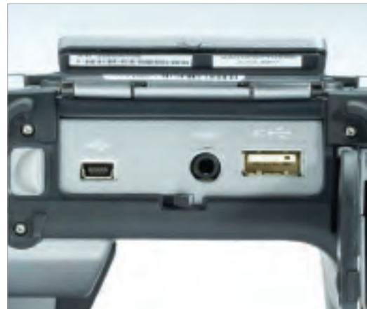
From Left to right: USB mini for PC image download, NTSC video, USB-A for memory stick image transfer